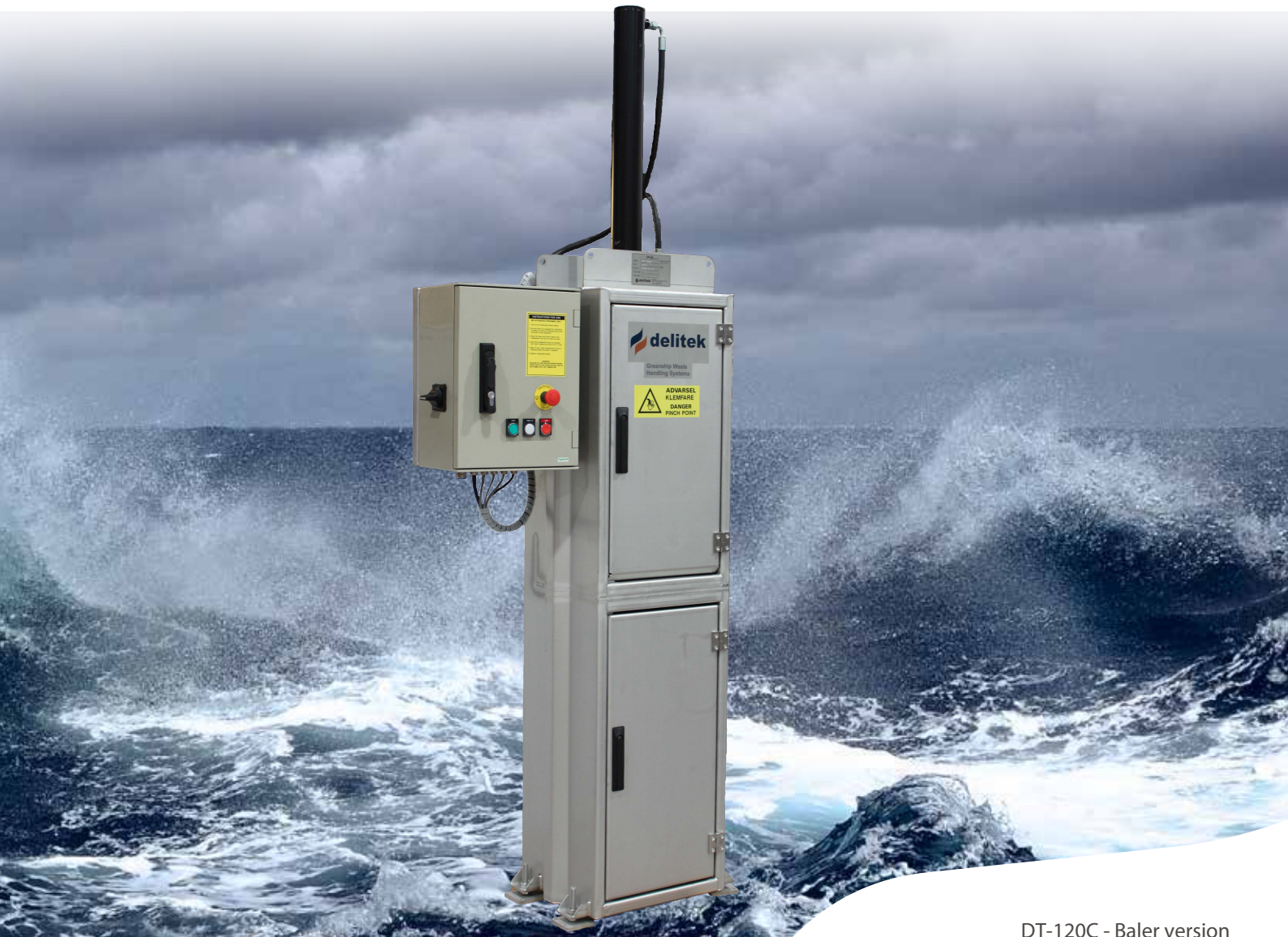
DT-120C - Baler version

“Waste management equipment for the demanding maritime and offshore industry that gets the job done efficiently, safely and in an environmentally responsible manner.”